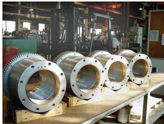
Tie bar nuts; steel, bronze, geared or sprocketed.