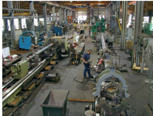
Numerous manual lathes available for quick turnaround break-down requirements.