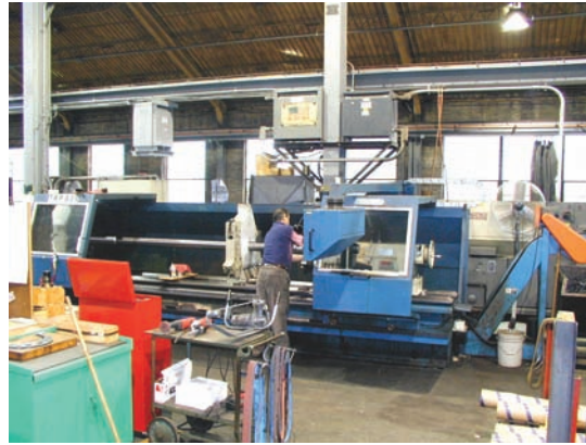
Small and mid-sized CNC turning and milling available for smaller bars.