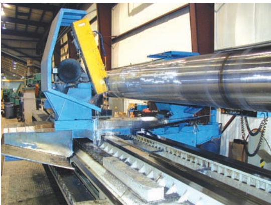
Same machine polishing helps achieve close tolerance and finishes in one step.