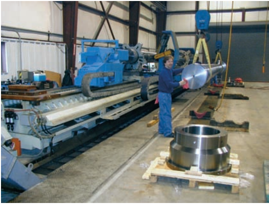
Large bar CNC threading to B/P tolerances or matched to mating nut.