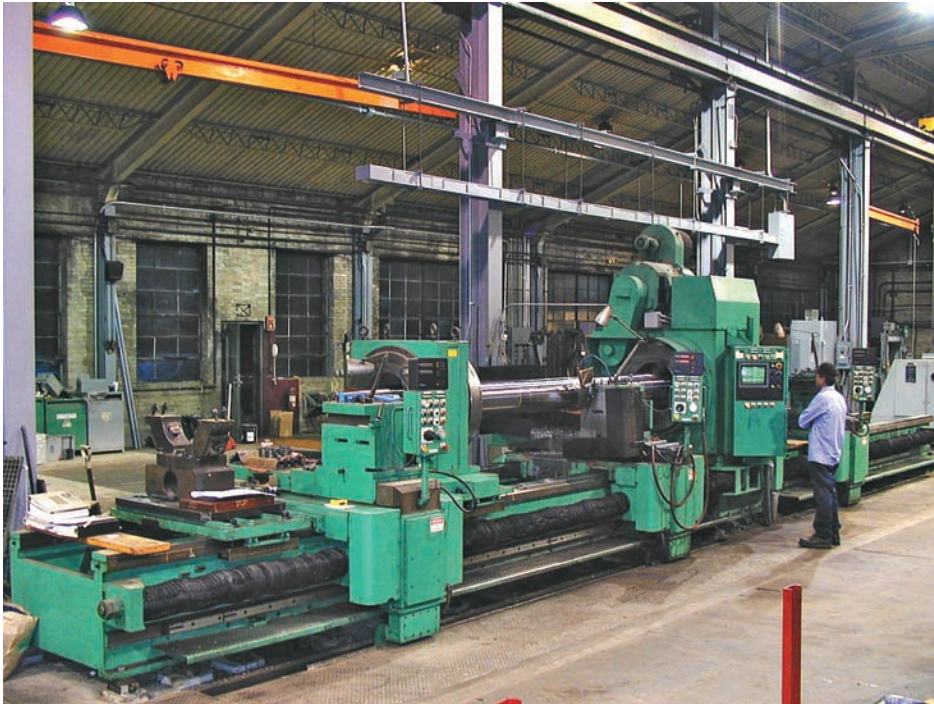
Close tolerance CNC turning measured with temperature compensating laser.