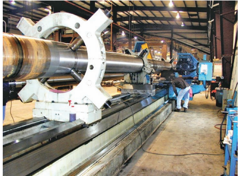
Long shaft CNC machining with live tooling for same setup secondary operations.

1055 North Shore Drive ◆ Benton Harbor, MI 49022 ◆ www.kelmacubar.com Phone 269-927-3000 ◆ Fax 269-927-3300