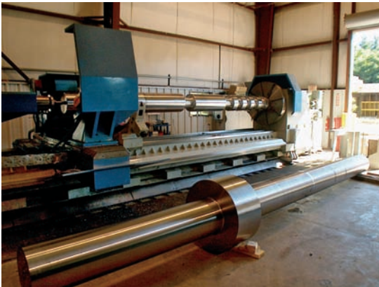
Stepped shafts or unusual shapes are easily machined with a 5-axis CNC lathe with live tooling.