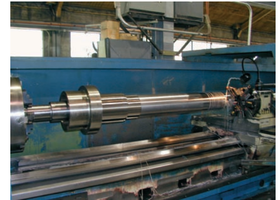
Sub-assembly with interference fit prior to or after machining is available.